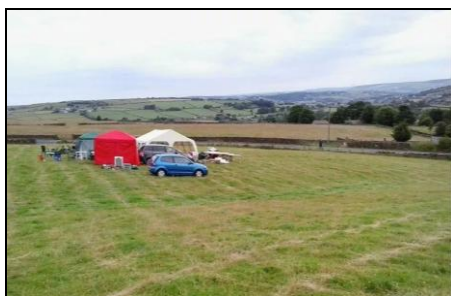
The stunning location for our Tour De France fundraiser