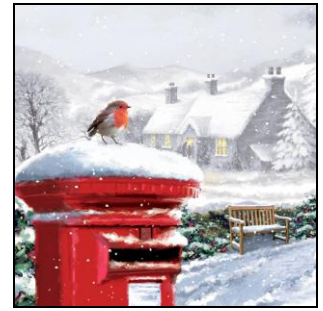
Robin on Postbox